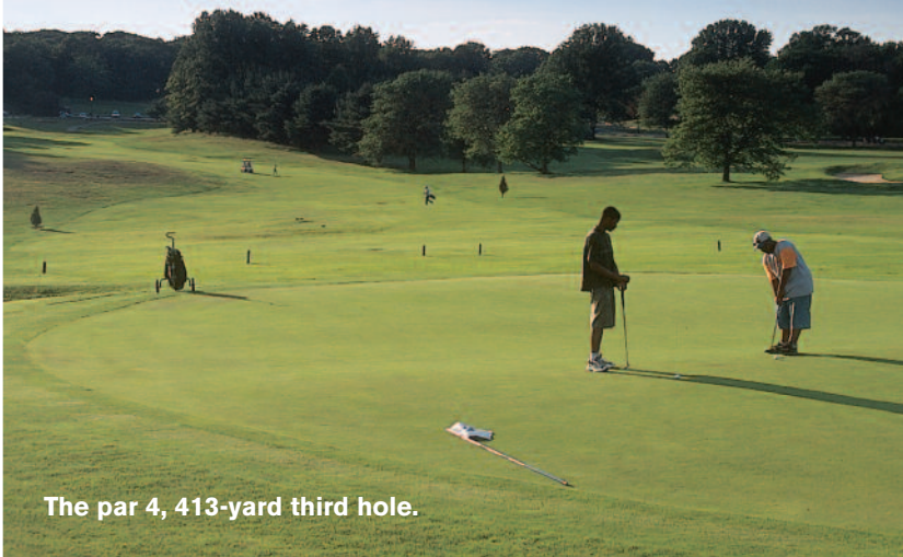
The par 4, 413-yard third hole.