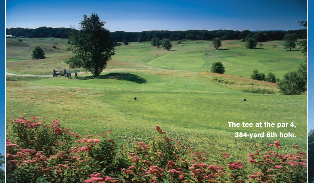
The tee at the par 4, 384-yard 6th hole.

“ I never saw a country which more delighted me. A man might travel many hundred miles and not find so fine woodlands as about in this neighborhood.”