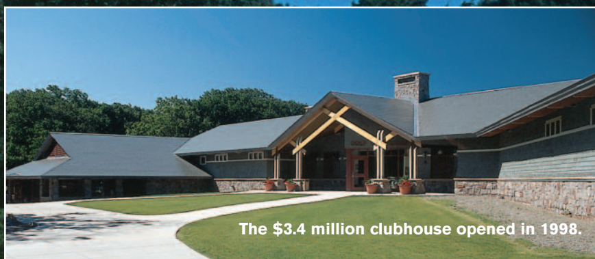
The $3.4 million clubhouse opened in 1998.