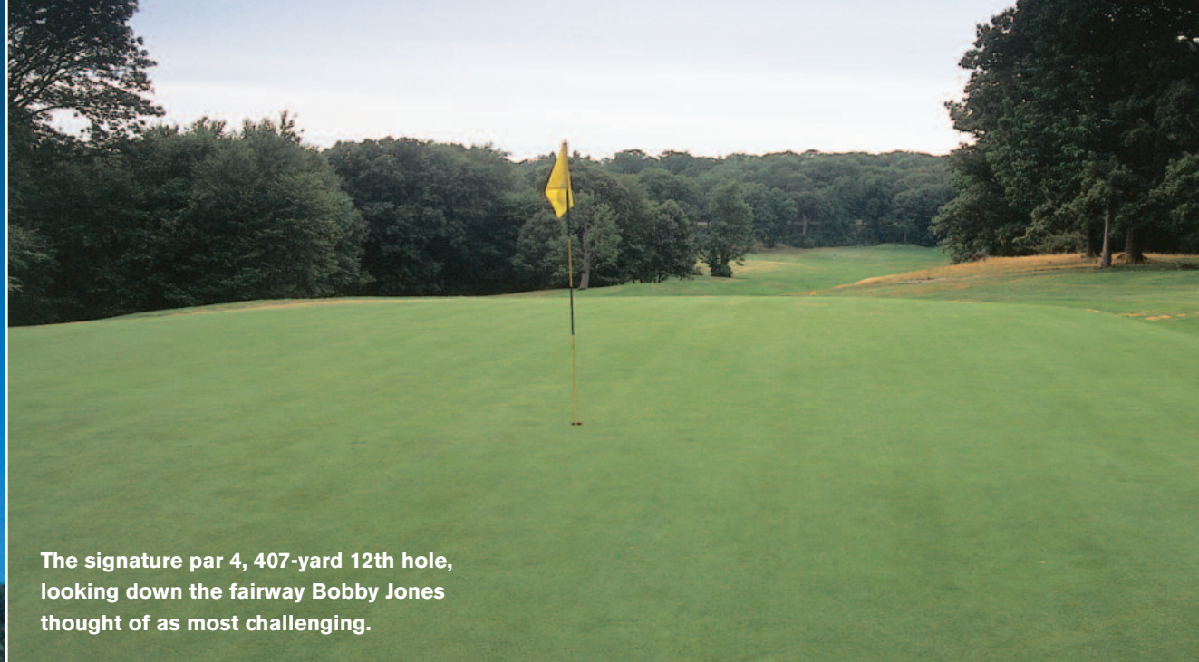
The signature par 4, 407-yard 12th hole, looking down the fairway Bobby Jones thought of as most challenging.