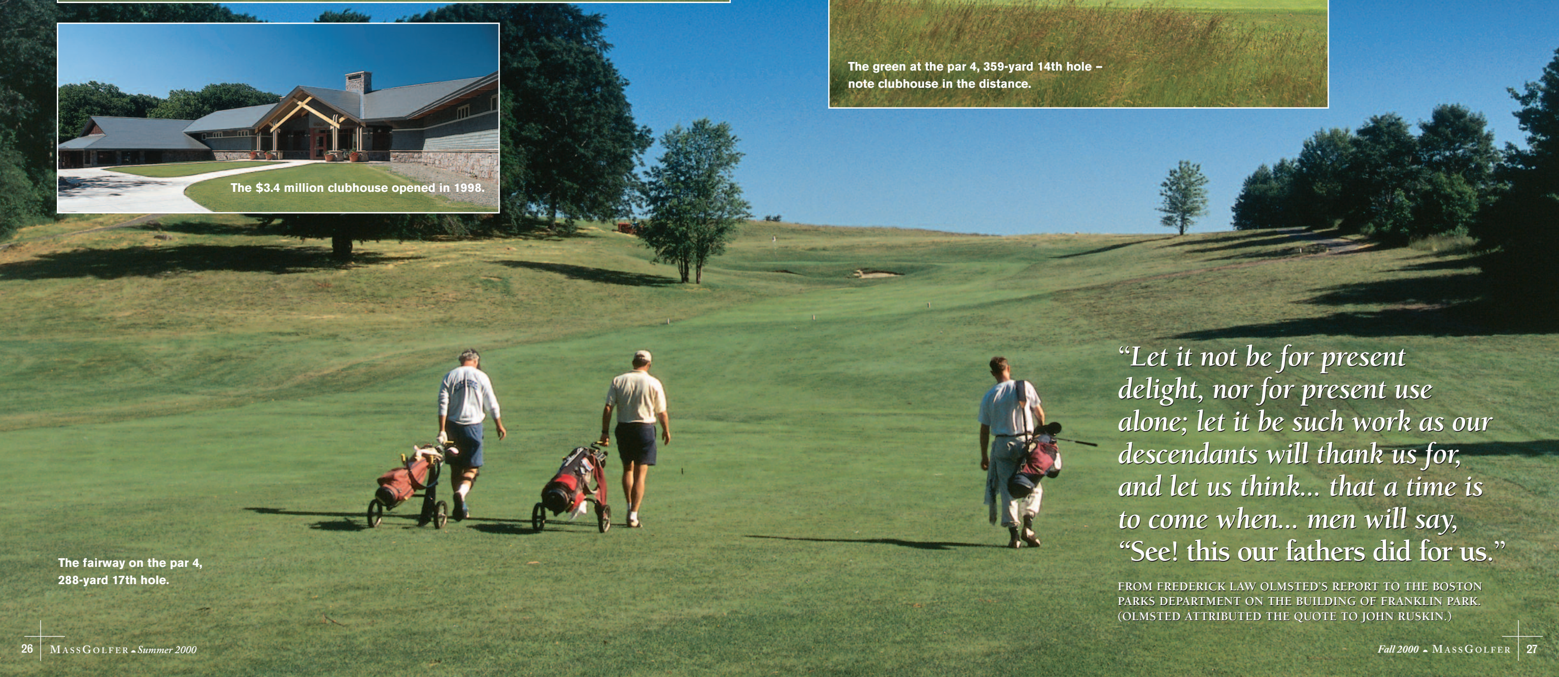
The fairway on the par 4, 288-yard 17th hole.